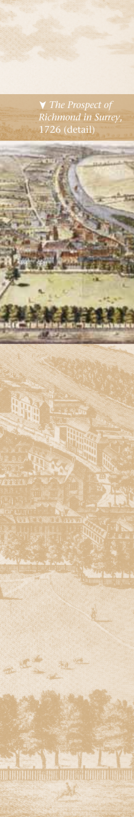
▼ The Prospect of Richmond in Surrey, 1726 (detail)